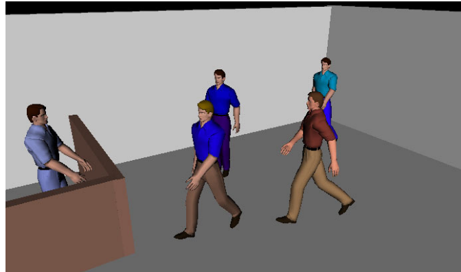
Figure 3: Screenshot of the environment

mechanism to ensure that the agents will follow their path without being blocked by other static or animated agents. An agent can perceive each entity (object or agent) that is visible by it and lies within its perception distance and angle.